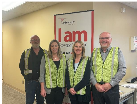
Cardinal Health and Vendor Management Reps

During our time together we were also able to do a site visit with Cardinal Health in Mount Pearl. The Cardinal Health team provided a tour of their warehouse facility and overview of their order fulfillment and warehouse management processes. The team was truly impressed at Cardinal's operation as well as their focus on the patients at the end of the products they supply and distribute. We appreciate the Cardinal team for their time and great work in supporting our health supply chain and patient care in Newfoundland and Labrador!